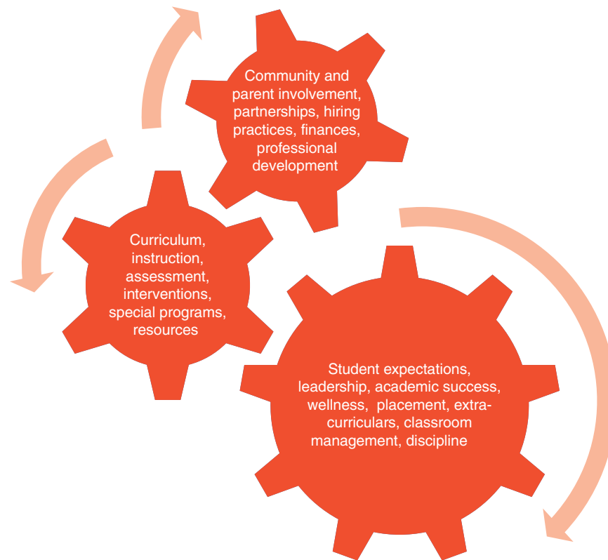
FIGURE 1.1 • Systemic Transformative Levers

These attributes and factors of our system will be used as leverage points for change.